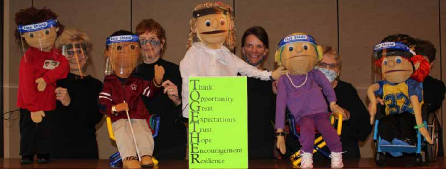
Puppeteers prepare for a Kids on the Block presentation.